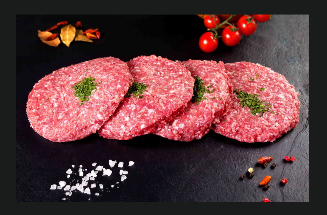
BLACK ANGUS SUPPLY